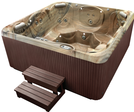
Tempo shown with Tuscan Sun shell, Espresso cabinet and Everwood® step